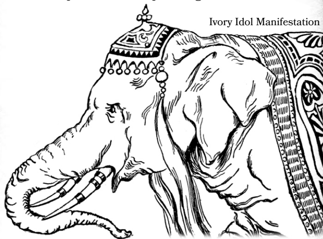
Ivory Idol Manifestation

An empty chamber, the walls decorated with frescoes from floor to ceiling. The paintings depict groups of people that worship an elephant-shaped entity from beyond the veil. The followers appear to follow the alien god without question in all paintings.